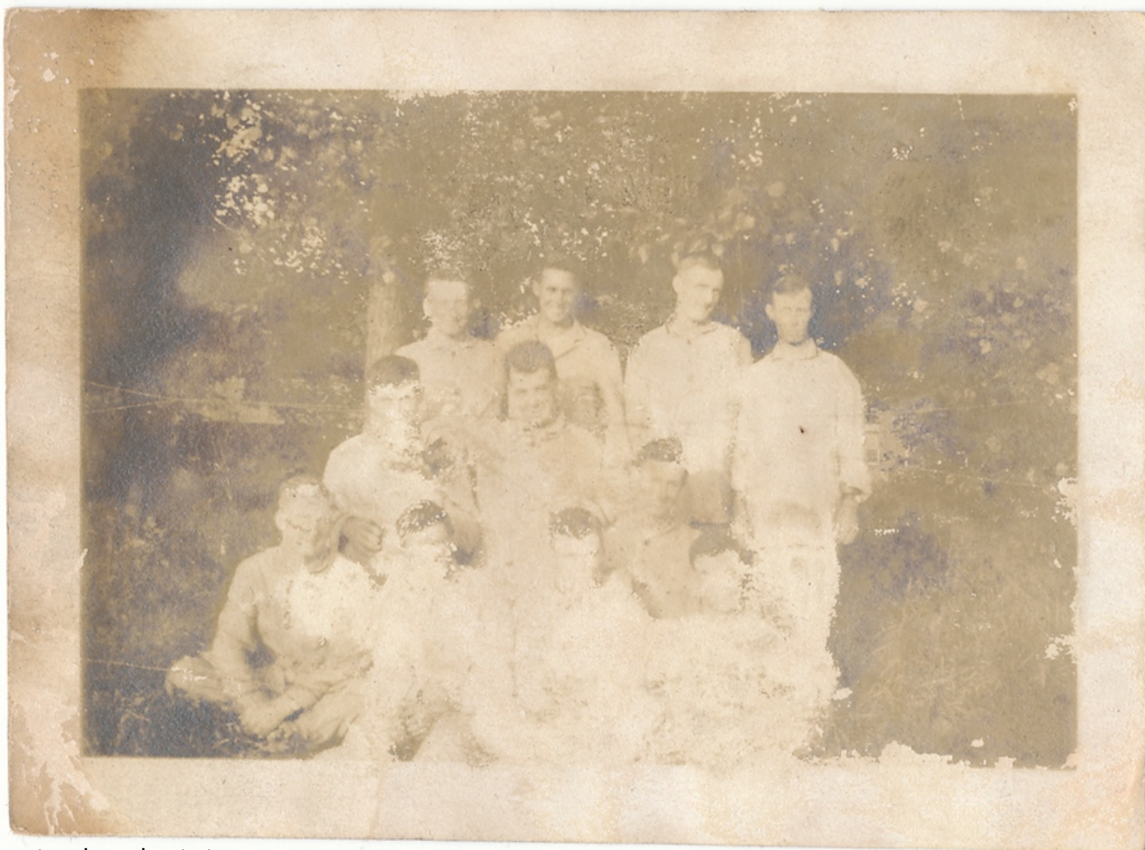
Every story is a ghost story.